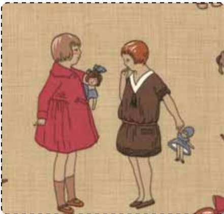
13610 12* Oyster