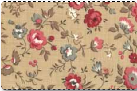
13617 12* Oyster