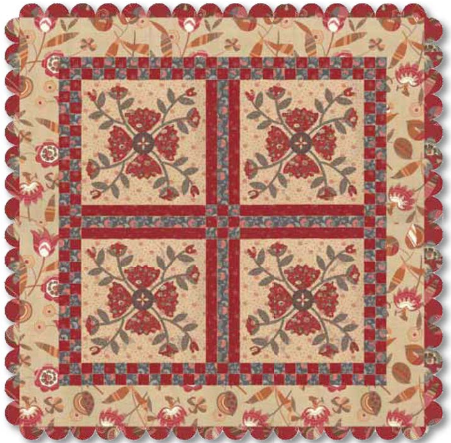
FG ODILE or FG ODILEG –Petite Odile Size: 77"x 77"