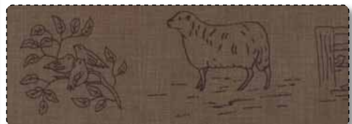
13611 16* Stone