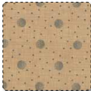
13618 13 Faded Denim