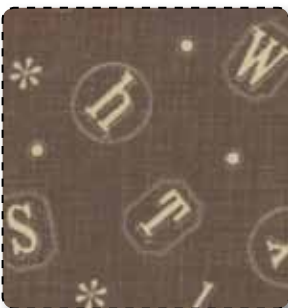
13612 15* Stone