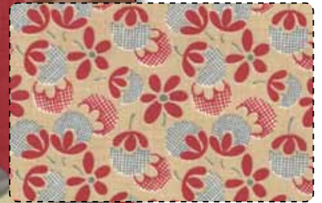
13615 12 Oyster