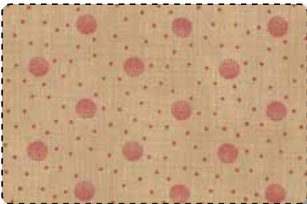
13618 12* Faded Red