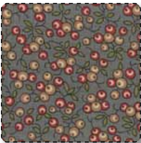
13616 13* Faded Denim