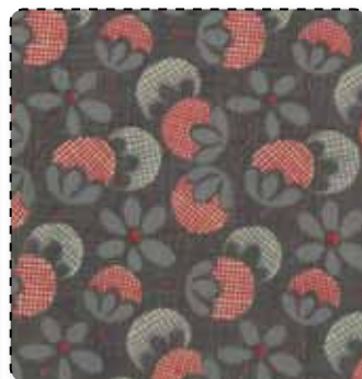
13615 14* Dark Denim