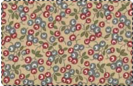
13616 12 Oyster