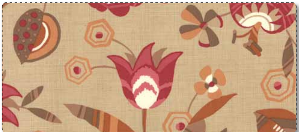
13613 12 Oyster