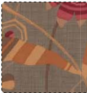
13613 15 Stone