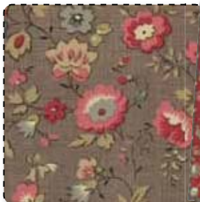
13617 15* Stone