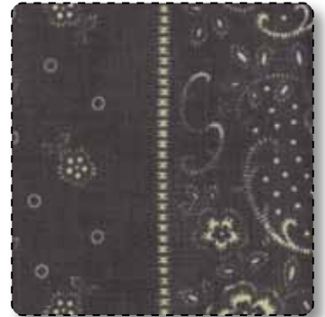
13619 16* Dark Denim