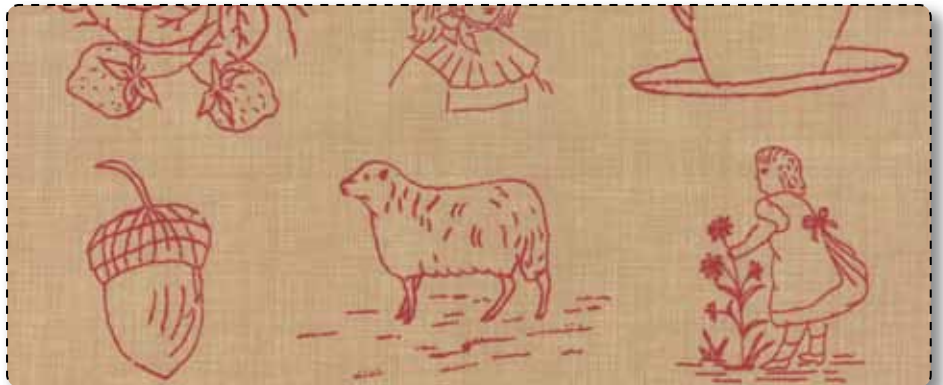
13611 12* Faded Red