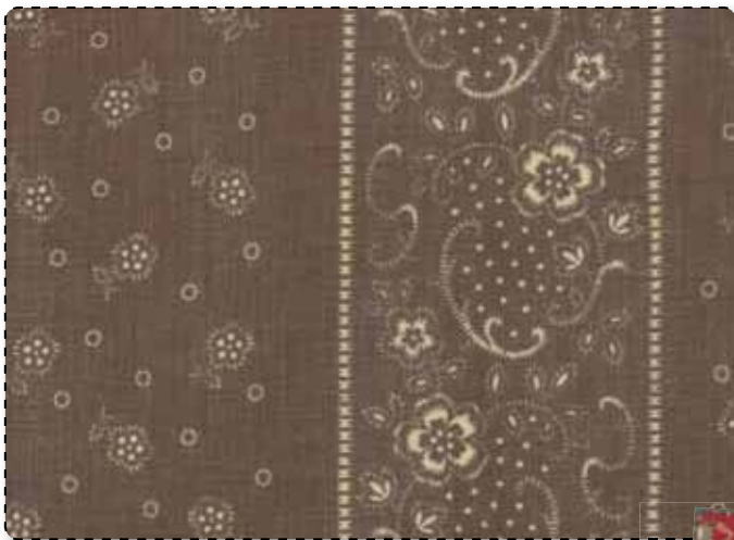
13619 15 Stone