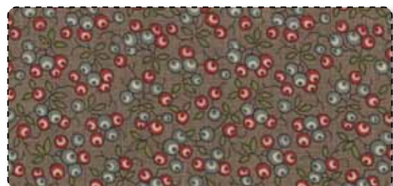
13616 15* Stone