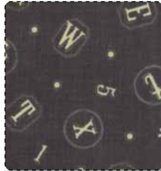
13612 14 Faded Denim