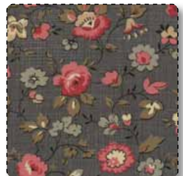
13617 14 Dark Denim