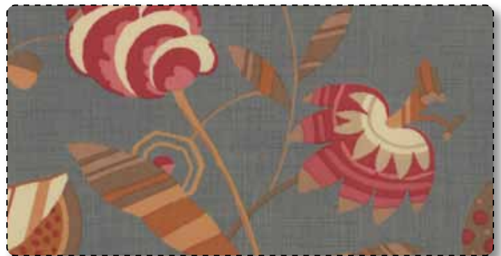
13613 13 Faded Denim