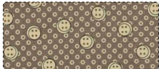
13614 16* Stone