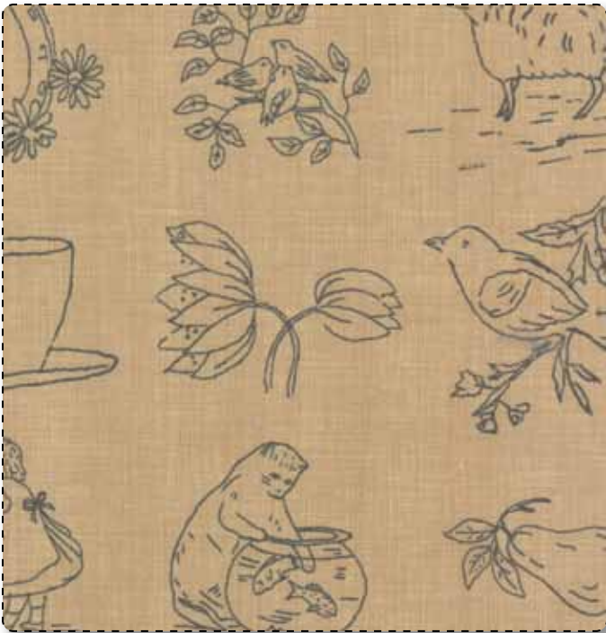
13611 13 Faded Denim