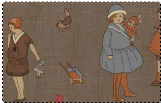
13610 15* Stone