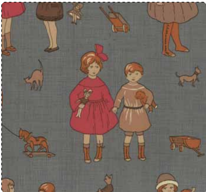
13610 13* Faded Denim