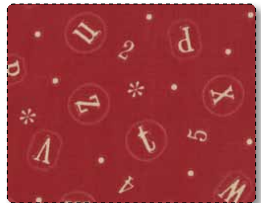
13612 11* Faded Red