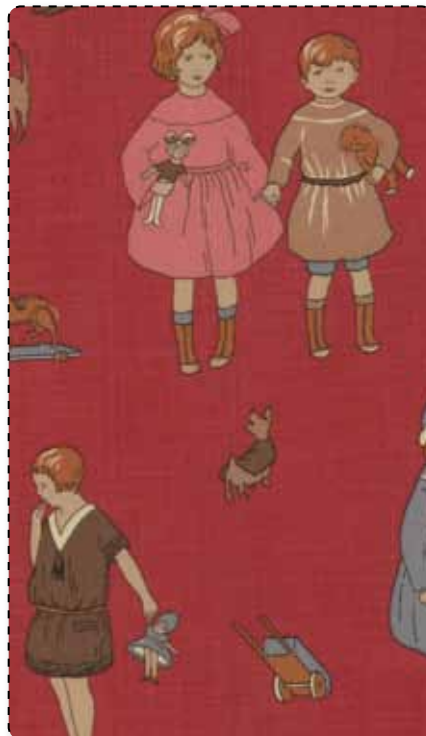
13610 11 Faded Red