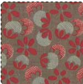
13615 15 Stone