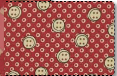
13614 11* Faded Red