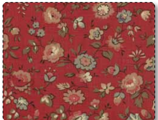
13617 11* Faded Red