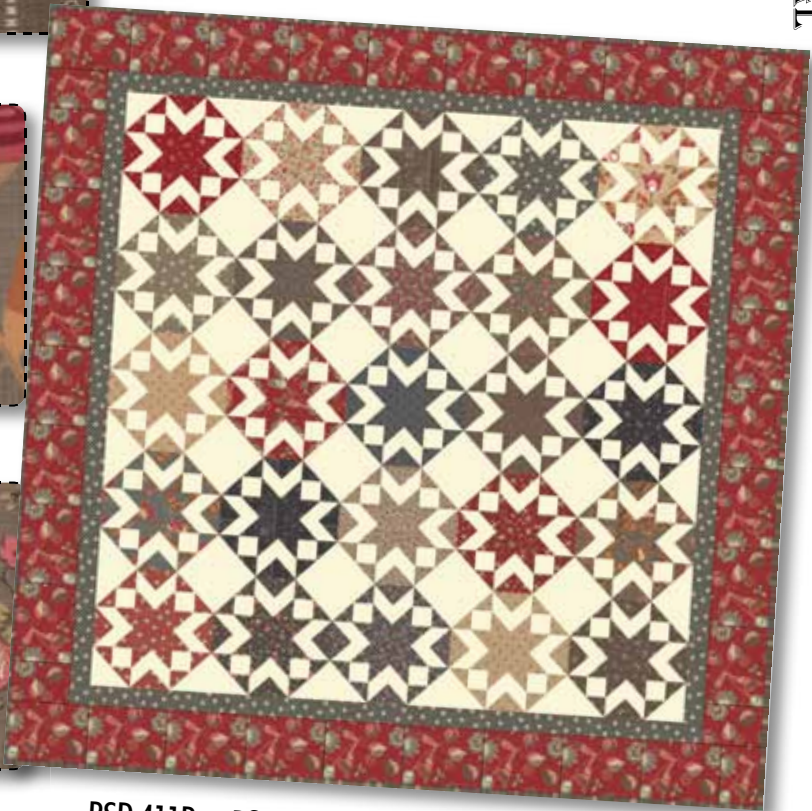
PSD 411P or PSD 411PG – Odie Stars Size: 76" x 76"