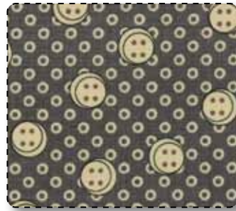
13614 15 Faded Denim