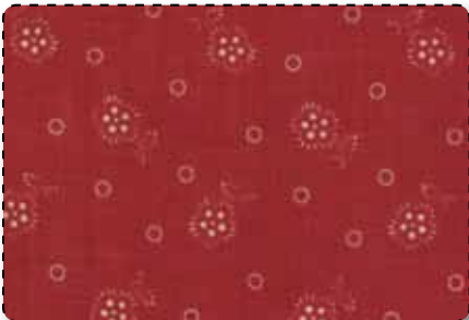
13619 11* Faded Red