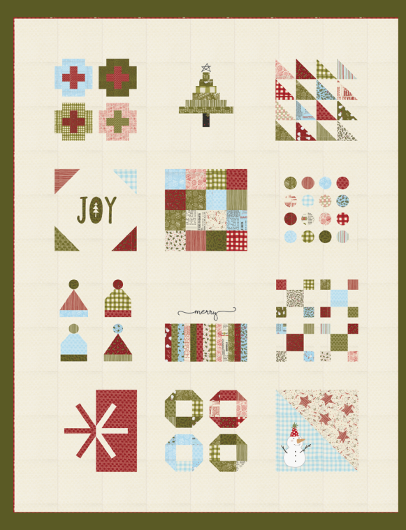
SW P319 Merry Merry 61" x 79" AB Friendly