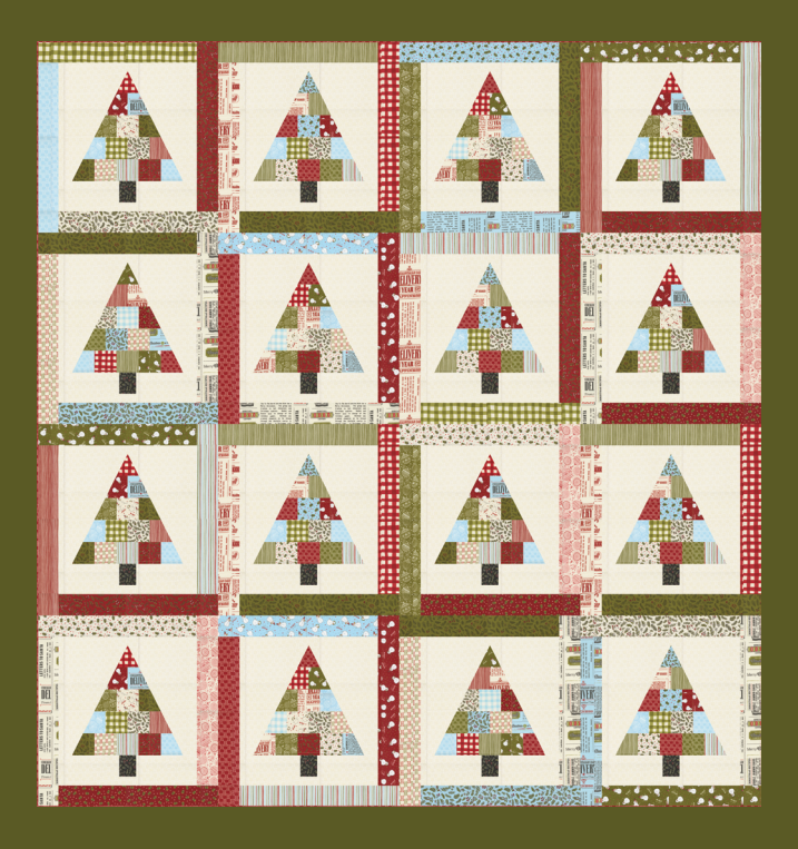
SW P321 The Tree Farm 68" x 72" JR and LC Friendly