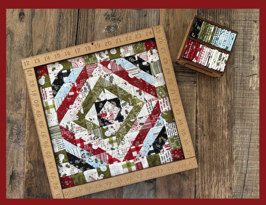
Ask your sales professional to see more Just a Little Box fabric collections.